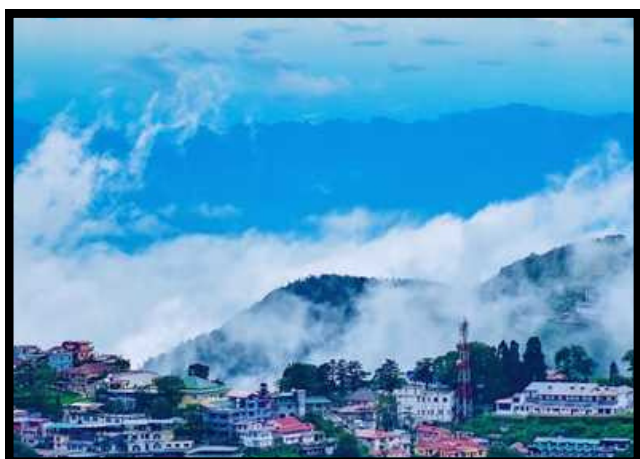
Mussoorie 02 Nights