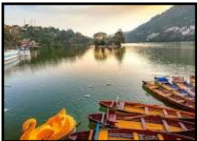
Nainital 02 Nights