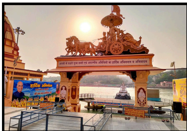
Rishikesh 01 Night