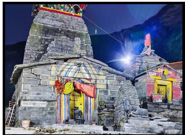
Kedarnath, Tungnath, Auli, Kausani, Nainital, and Corbett