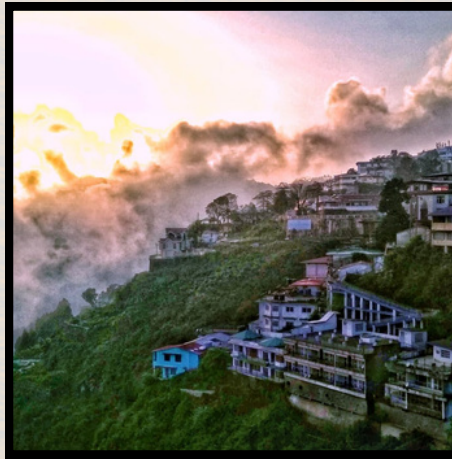
Mussoorie 02 Nights