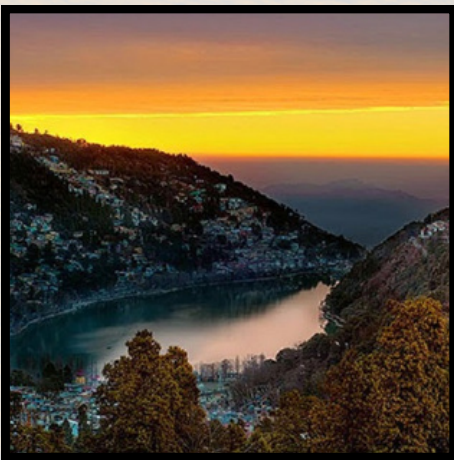
Nainital 01 Night