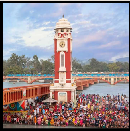
Haridwar 02 Nights