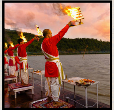
Rishikesh 01 Night