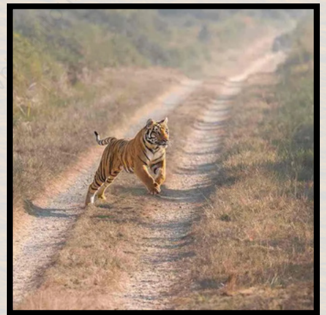
Corbett 01 Night