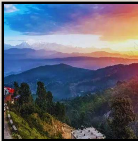
Kausani 02 Nights