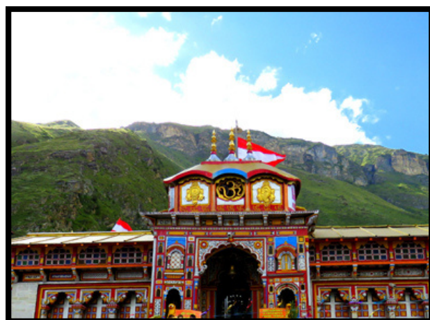
Do Dham Yatra