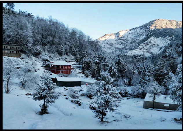
Chopta 02 Nights