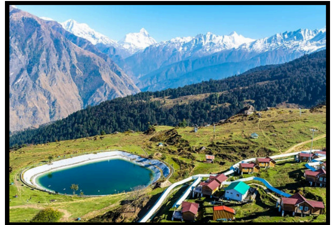
Auli 02 Nights