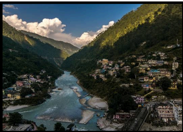
Karnaprayag 02 Nights