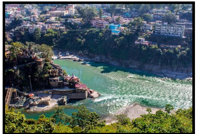
Rudraprayag 02 Nights