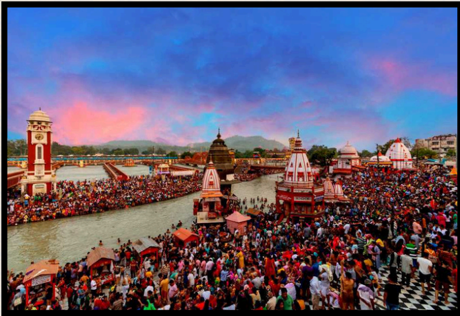
Haridwar 01 Night