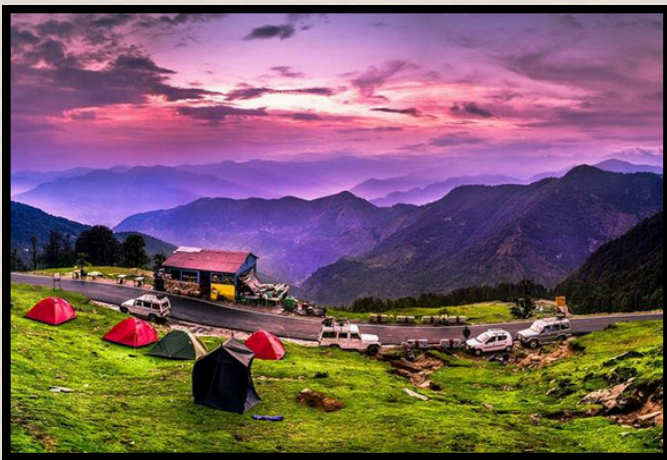
Chopta 02 Night