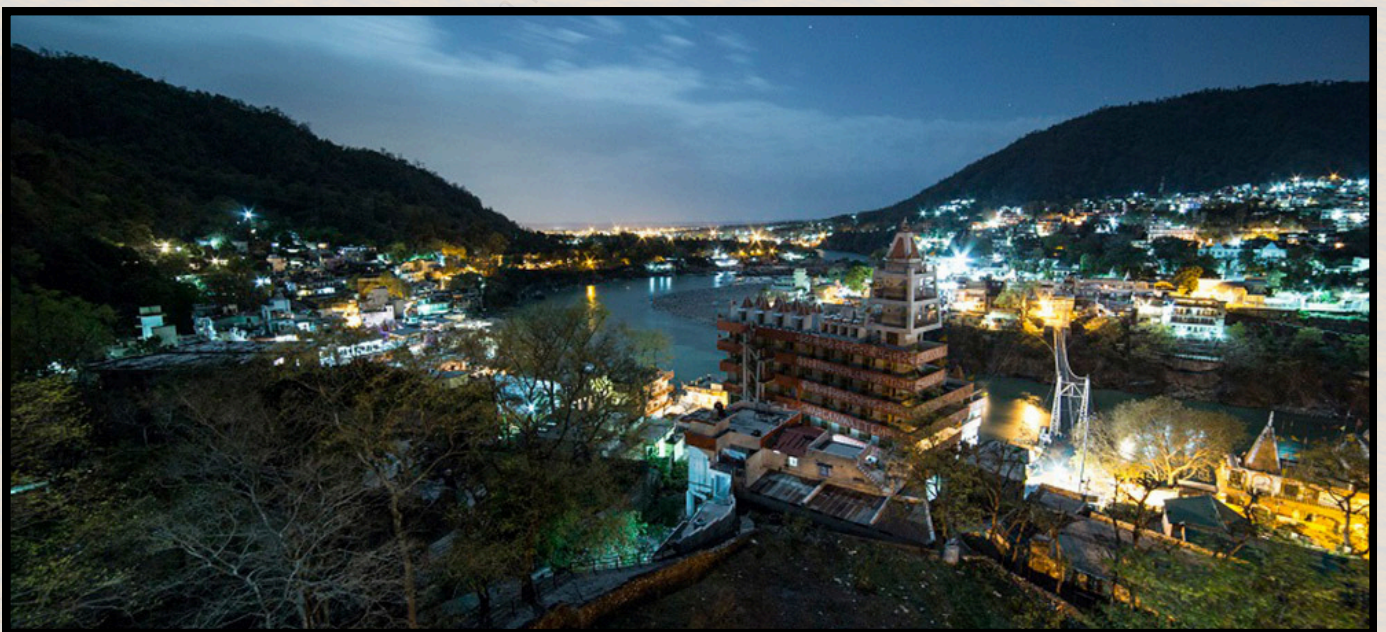
Rishikesh 01 Night