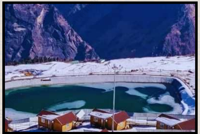
Auli 02 Night