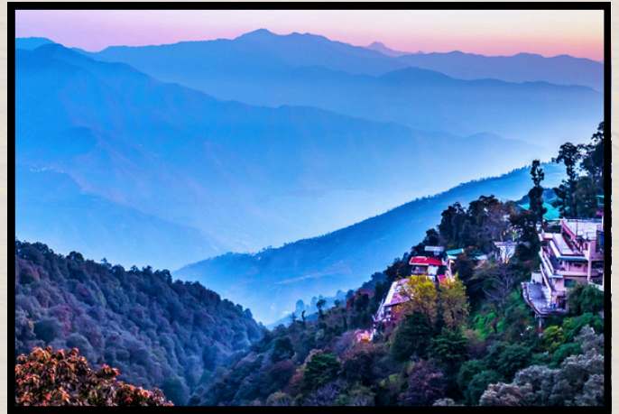
Mussoorie 02 Nights