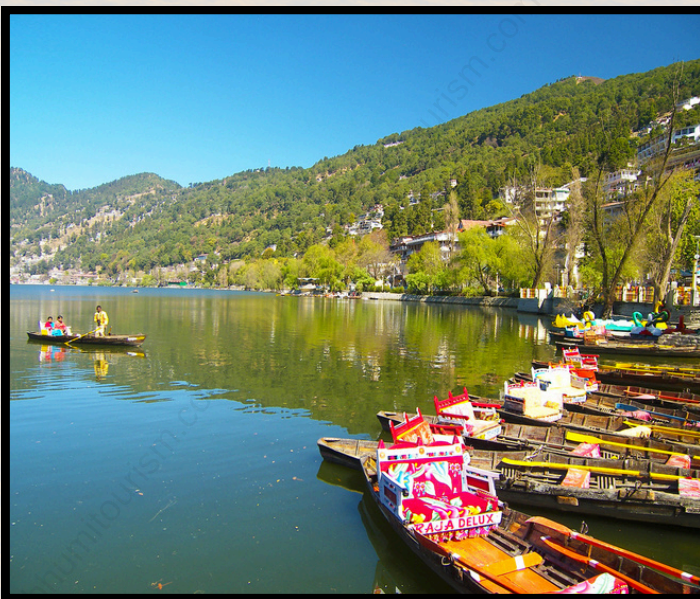
Nainital 02 Nights