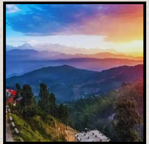
Kausani 01 Night