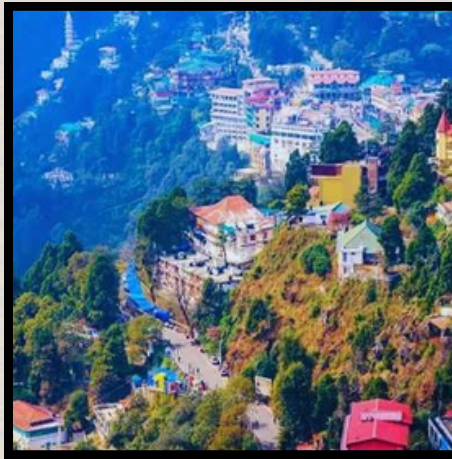
Mussoorie 02 Nights