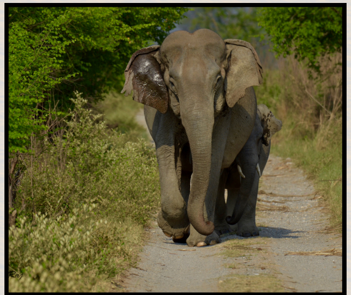
Corbett 01 Night