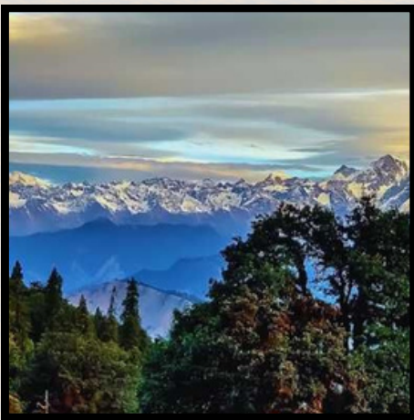
Chopta 01 Night