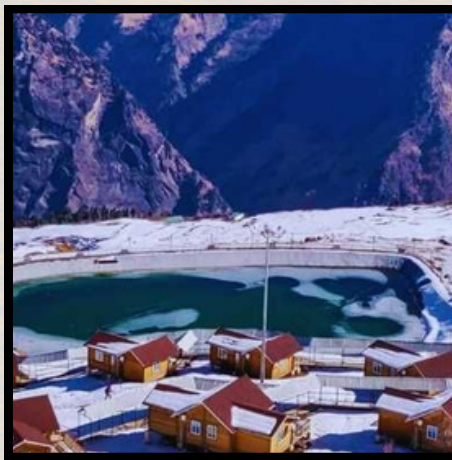
Auli 02 Nights