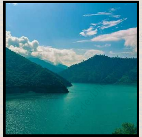
Tehri 01 Night