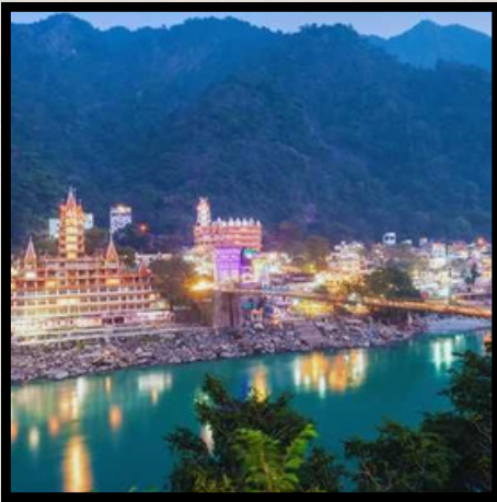
Rishikesh 02 Nights